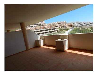
Price: 165,000 € Printing day : 13th September 2025

M<sup>2</sup>: 109 Parking places: by request