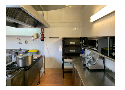
Price: 425,000 € Printing day : 21st August 2025

Bathrooms: by requestM²: 150Property Type: CommercialParking places: by request